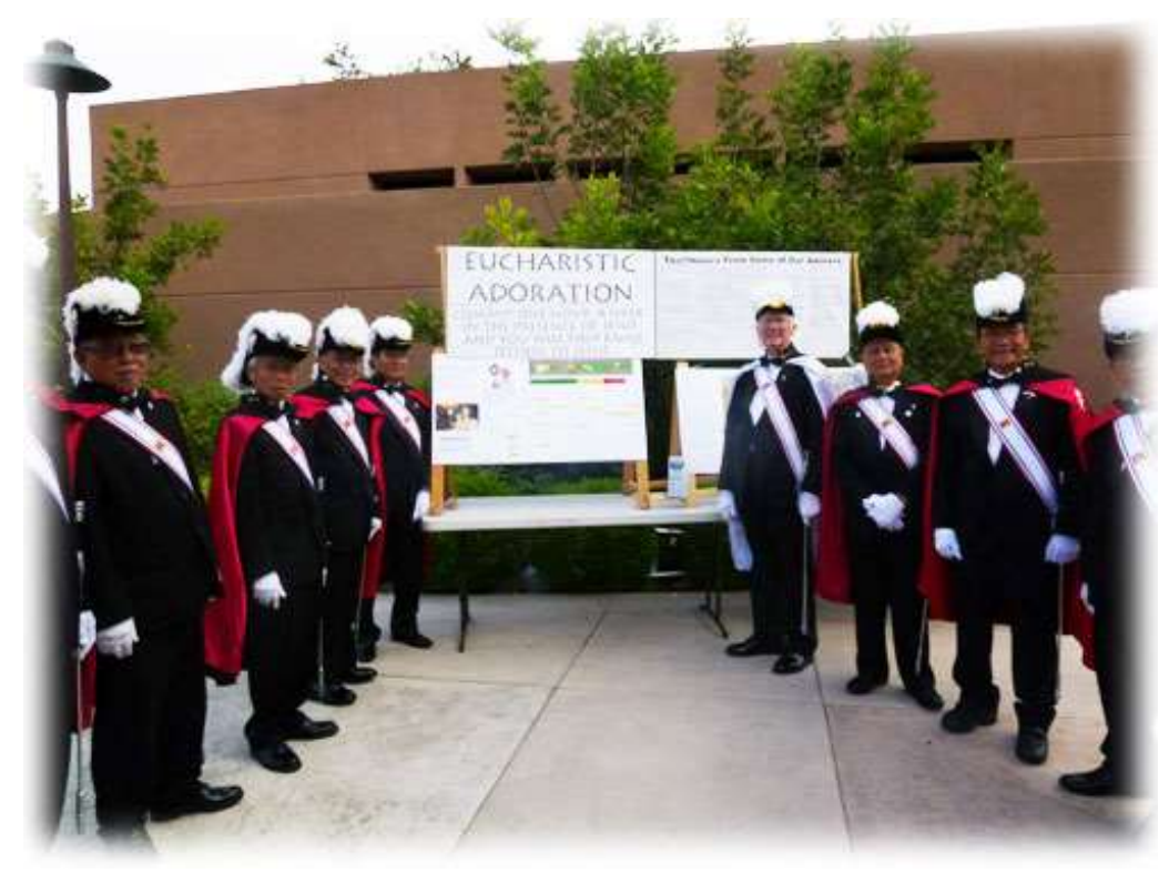
(and Knights membership will grow).

As has already been stated: WHEN THE KNIGHTS OF COLUMBUS BECOME THE CHAMPIONS OF EUCHARISTIC ADORATION, ALL HEAVEN WILL REJOICE! (And the Catholic world will follow them to His Presence).